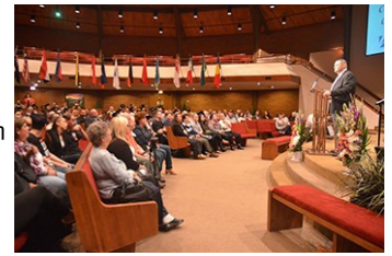
Over 300 attended the celebration

For over nine years, Warner Pacific's Adult Degree Program has partnered with Heald College, working closely with their career placement services to assist students desiring to pursue baccalaureate degrees after completing an associate degree at Heald. With this partnership in mind, a number of Warner Pacific staff jumped into action, planning an impromptu graduation celebration for these Heald students. The response was overwhelming, and within one day, the celebration had outgrown the facilities available on campus. Thankfully, friends at Mt. Scott Church of God (Portland) opened their doors with very little advanced notice, helping to celebrate the academic and personal achievements of those who successfully earned degrees from Heald College.