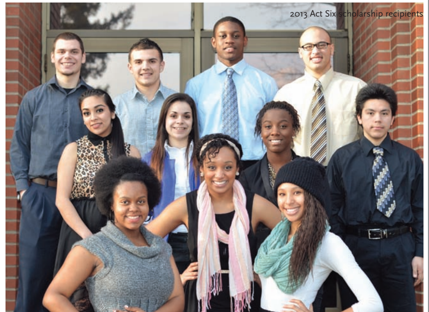
2013 Act Six scholarship recipients