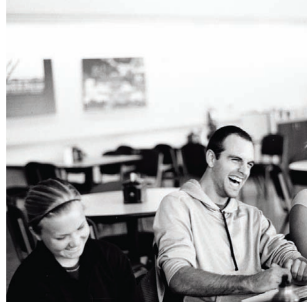
Learning Communities are a cohort based learning strategy that provides a rich support system to facilitate the transition into college life.