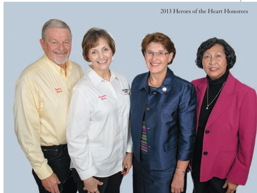
2013 Heroes of the Heart Honorees

STAY UP TO DATE on all of the latest news from Warner Pacific with “In the City,” our monthly email newsletter! Email inthecity@warnerpacific.edu to subscribe.