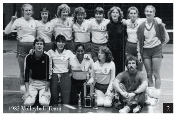
1982 Volleyball Team