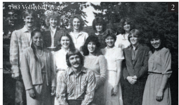
1983 Volleyball Team