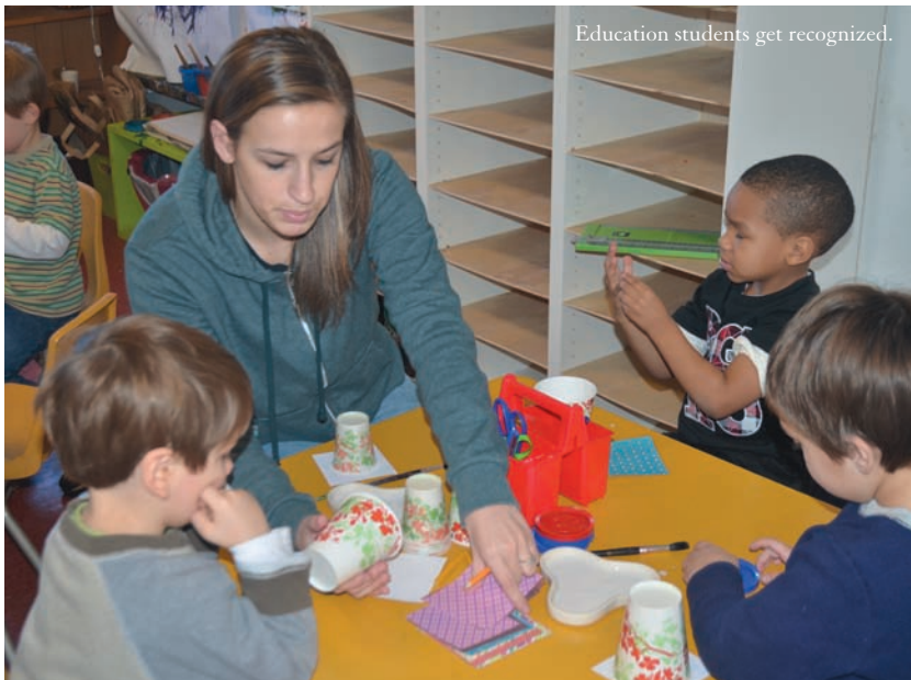
Education students get recognized.