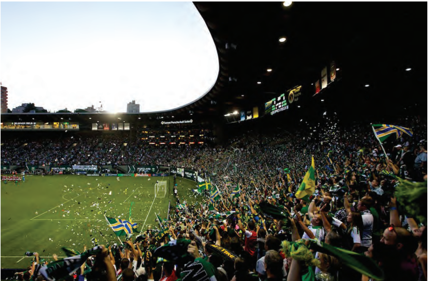
As the sun begins to set on Jeld-Wen Field, the Portland Timbers take on the Colorado Rapids at the August 31, 2012 match. See related story on pages 10-12.

October 16, 2012 • Volume 4 • Issue 1 • Warner Pacific College