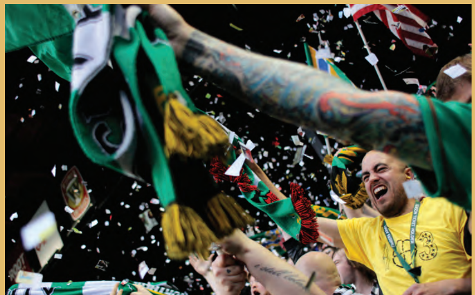
The Timbers Army displaying their passion for the team in a 0-0 match on May 5, 2012.

I am grateful to have been offered the opportunity to work for one of Portland's professional athletic organizations and cannot wait to join my fellow employees and many new ones in February. Onward Rose City!