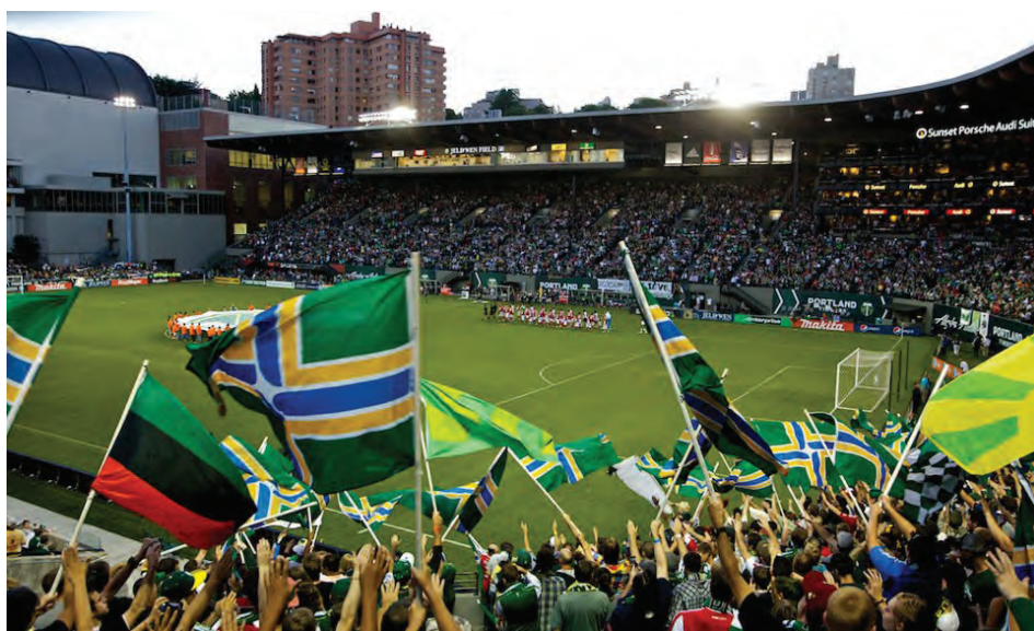
The Timbers Army cheer as the Portland Timbers take the field against the Colorado Rapids on August 31, 2012.

Once the game is kicked off the chants of "Let's go PTFC!" from the fans get twice as loud. There are occasional vulgar chants, and you can hear fans from all over yelling at the players and the referees on the field. Some fans get too rowdy at the Timbers games, but Jeld-Wen has security surrounding the entire field to make sure nothing interferes. From what I've seen, the security is well poised. They stand with their backs to the field and stare into the crowd to make sure no one is doing anything they're not supposed to. Even though the security can't watch the game, you can tell most of them are in a good mood anyway because of the general feeling in the entire stadium. Continued on page 12.