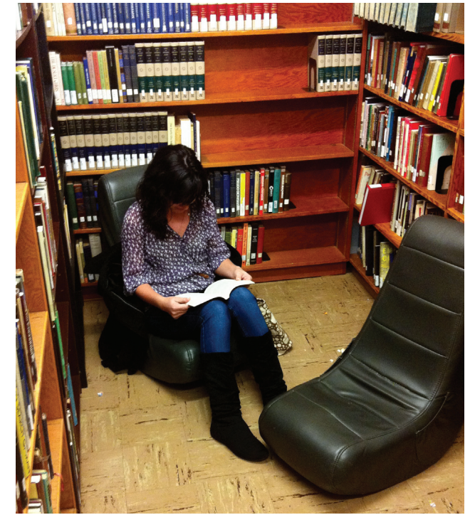
The library Loft is quiet and has some seating for studying.