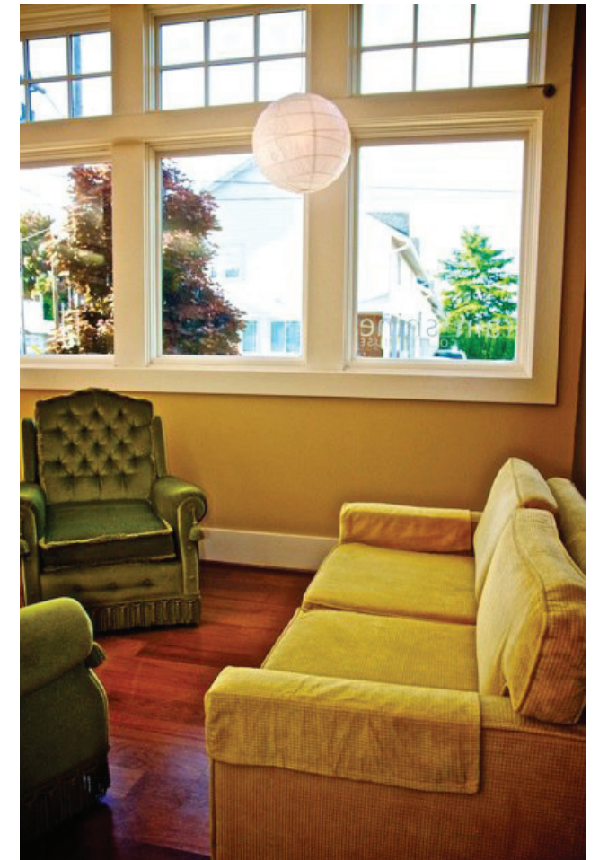
Rain or Shine Coffee House is a popular off-campus study space for students.