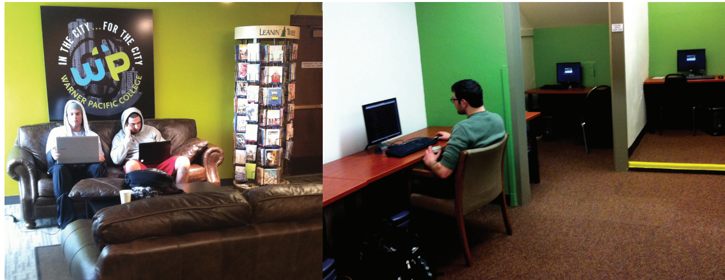
Students work on assignments in the study space in the bookstore and in the 24-hour computer lab in A.F. Gray Hall. These places have been recently added or renovated in an effort to meet student needs.