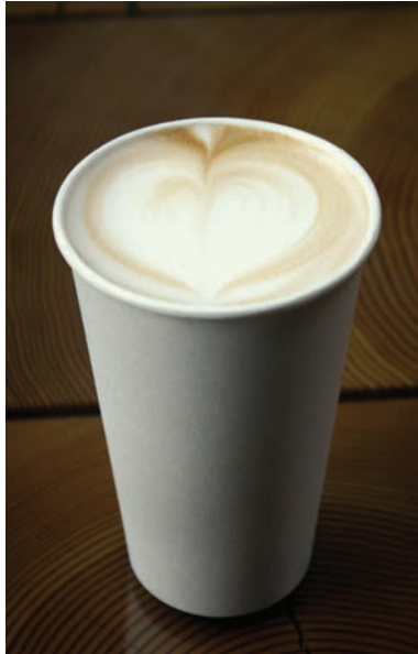
A warm cup of Stumptown coffee.

At Stumptown the air is permeated with the essence of brewed coffee beans. If you are a coffee nerd, Stumptown is the perfect place to go and get your geek on. Stumptown is the only coffee shop on this list that roasts its own beans, taking meticulous care to provide a superior product for their customers. Stumptown offers the widest array of coffee items; from your regular mocha to a real, non-Starbucks, macchiato they have it all. Stumptown is a good place to get away and study. While it doesn't have comfy couches, it is convenient for laptop use. For those who thrive in an electric atmosphere, Stumptown has the energy to inspire you.