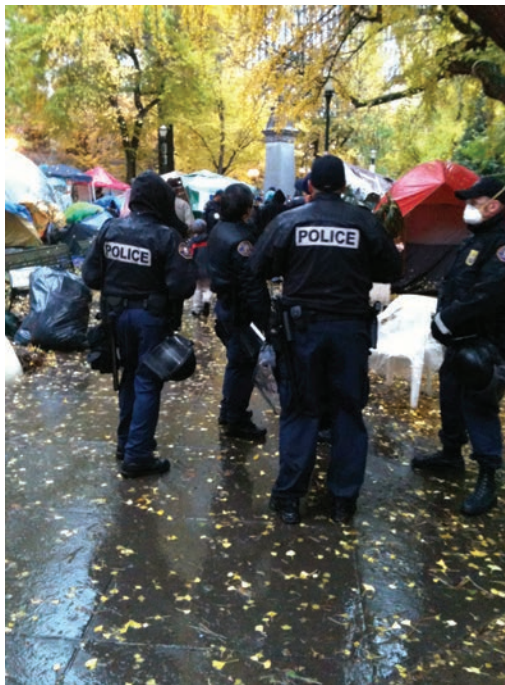
Portland Police gathered outside of an Occupy Portland encampment on November 12, 2011.

We cannot take all of our information from one source. Occupy Portland is an ongoing protest and the narrative is changing hourly. Whether you view it as annoying, meaningful, or history being changed its here to stay...for now.