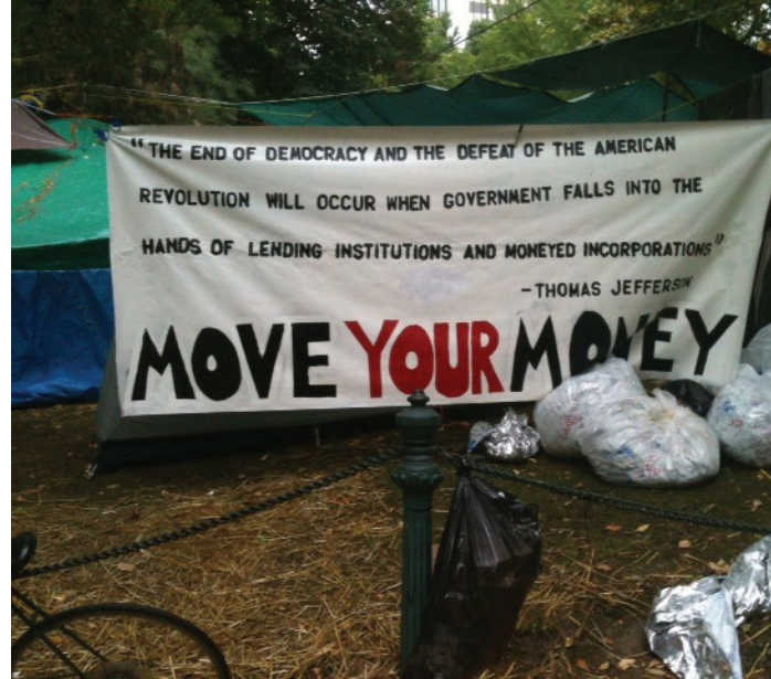
An original "Occupy Portland" sign.

Occupy's big nationwide movement was called Bank Transfer Day; the main objective was to protest Bank of America for announcing a $5 debit charge, which was later revoked. The premise was to keep money local in credit unions or completely shut down bank accounts and keep money in a coffee can at home. After the Bank Transfer Day and the uptick in crimes, Mayor Sam Adams decided that this protest had gone on long enough and set the eviction date for November 13 at 12:01 a.m.. Original protestors had left before the deadline hit, and the remaining were a mixture of "homeless, mentally disabled, and the aggressive who were looking for a fight," according to an on-duty police officer I spoke with. Thousands of people showed up downtown to watch the events unfold in front of them, but when the clock struck 12:02 a.m. and there wasn't an eviction, people began to get antsy. Preventing the riot is just as hard as controlling it after the occurrence. The police did what was in the best interest for the spectators, the protestors, and themselves. Having the patience to allow those events to occur on their own, without a concrete game plan, was the best the authorities could have hoped for. Police