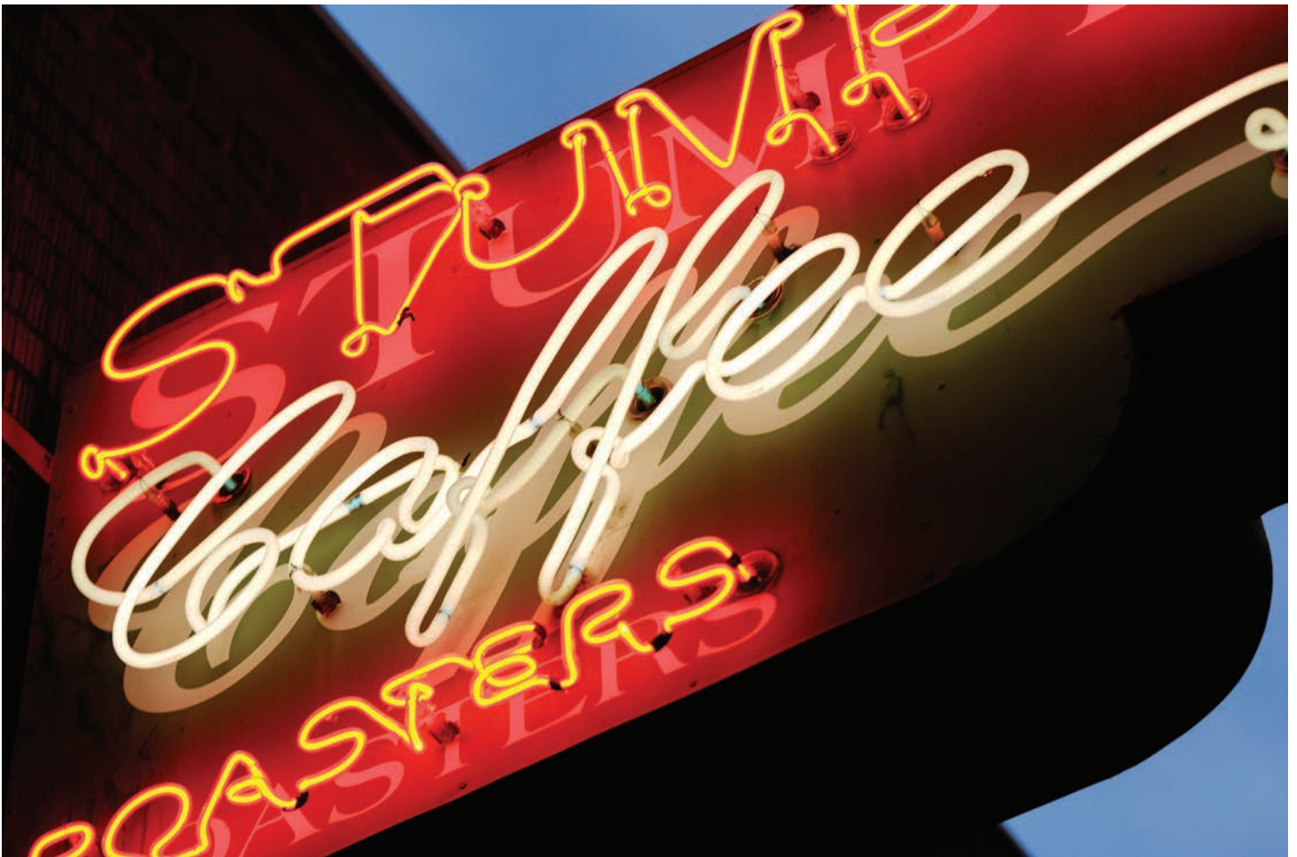
Students explore Portland coffee culture. See story, page 8.

December 5, 2011 • Volume 3 • Issue 2 • Warner Pacific College