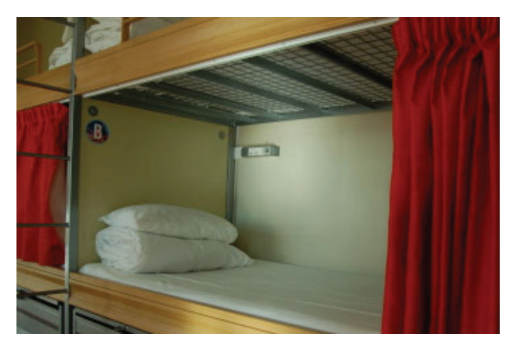
A bed in a Paris hostel.

(yes, like the one the girls on America's Next Top Model stayed in) for $18/night. Depending on the city, time of year and amenities, a bed in a hostel can go for less than $10! The hostels I stayed in knocked off 10% off my first night's stay for being a student and showing my ISIC.